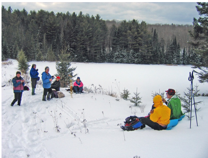
Six miles XC, almost all downhill, past lovely Podunk Pond in Strafford