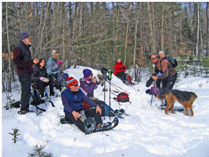
Above: We have done the Merrill Loop, east of Ravine Lodge and Mt. Moosilauke, for the last four years. This is really back country skiing, and skins are required for the long climb. But the down hill is easy.