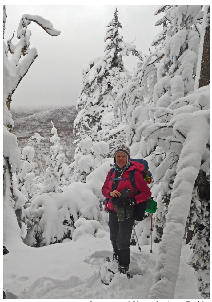
Report and Photo by Inge Trebitz

It did – but a fun one. Eight people showed up. The parking lot at the Kent Pond fishing access was not plowed. Neither was the Catamount one on Rt.4. Some driving back and forth until we had cars on both ends of the planned trip and could start hiking. Nobody had been on the trail, which meant for us taking turns to break it and jump over lots of small not-yet frozen brooks. At first we could follow the paw-print blue signs for the Catamount Trail, but once they turned off we had to go by memory from summer hikes. White blazes just don't show up very well on snow-covered tree trunks! "Could you brush that one off a bit?" "Don't you think we have to go higher (or lower, or more to the right...")? "Do you recall that ditch?""Would we find the Maine Junction if we just bushwhacked in a straight line?" According to Dick A.'s carry-on technology, it took us 77 minutes for that first mile to the point where A.T. and Long Trail part ways.