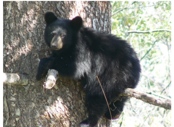
Recent bear sighting (not in Hanover)